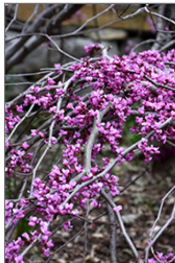
Ruby Falls Redbud flowers