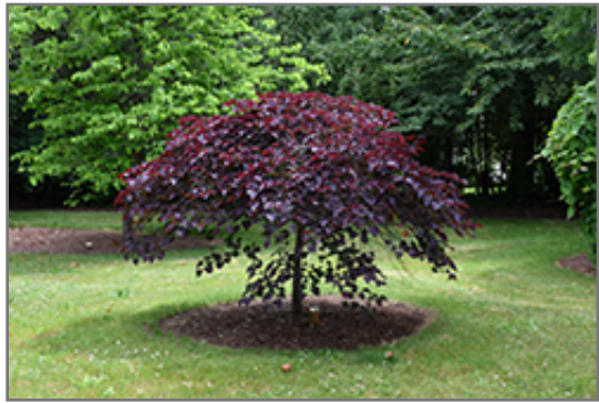
Ruby Falls Redbud

Ruby Falls Redbud will grow to be about 8 feet tall at maturity, with a spread of 6 feet. It has a low canopy with a typical clearance of 1 foot from the ground, and is suitable for planting under power lines. It grows at a medium rate, and under ideal conditions can be expected to live for 60 years or more.