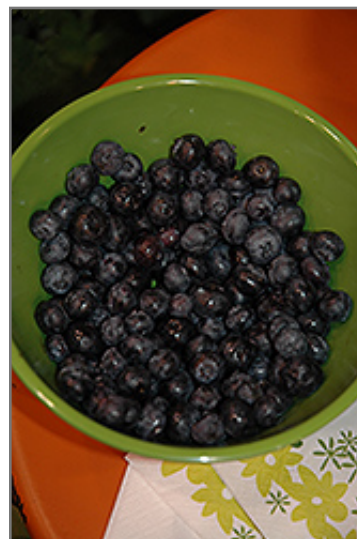
Peach Sorbet Blueberry fruit

This shrub is quite ornamental as well as edible, and is as much at home in a landscape or flower garden as it is in a designated edibles garden. It does best in full sun to partial shade. It does best in average to evenly moist conditions, but will not tolerate standing water. It is very fussy about its soil conditions and must have sandy, acidic soils to ensure success, and is subject to chlorosis (yellowing) of the foliage in alkaline soils. It is quite intolerant of urban pollution, therefore inner city or urban streetside plantings are best avoided, and will benefit from being planted in a relatively sheltered location. Consider applying a thick mulch around the root zone in winter to protect it in exposed locations or colder microclimates. This particular variety is an interspecific hybrid.