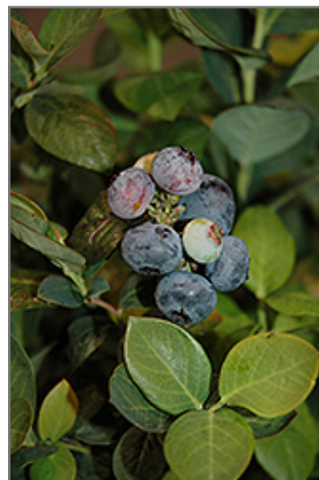
Peach Sorbet Blueberry fruit

Peach Sorbet Blueberry features dainty clusters of white bell-shaped flowers hanging below the branches in mid spring. It has green evergreen foliage. The glossy oval leaves turn an outstanding deep purple in the fall, which persists throughout the winter. It features an abundance of magnificent blue berries from early to mid summer.