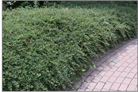
Coral Beauty Cotoneaster