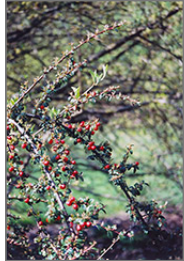
Coral Beauty Cotoneaster fruit

This shrub does best in full sun to partial shade. It is very adaptable to both dry and moist growing conditions, but will not tolerate any standing water. It is not particular as to soil pH, but grows best in rich soils, and is able to handle environmental salt. It is highly tolerant of urban pollution and will even thrive in inner city environments. This is a selected variety of a species not originally from North America.