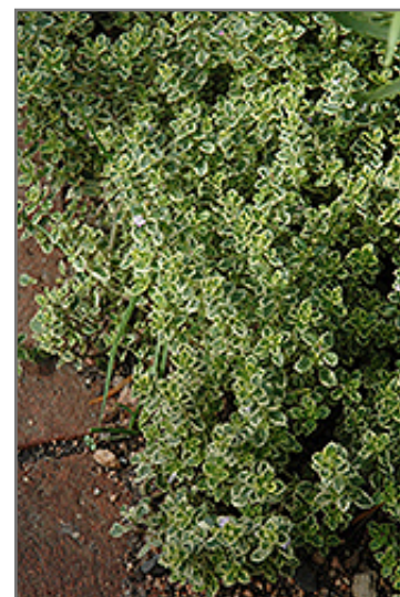
Aureus Lemon Thyme foliage