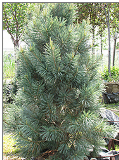
Vanderwolf's Pyramid Pine