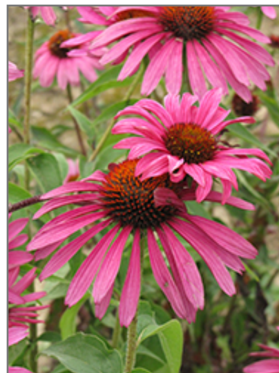
Ruby Star Coneflower flowers