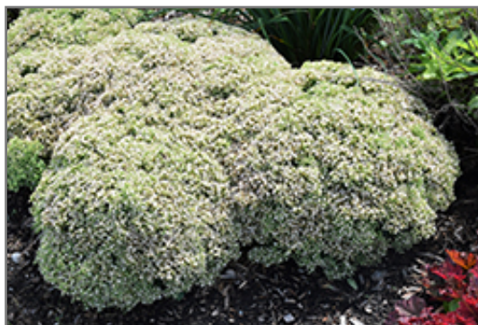
Rock 'N Round Bundle Of Joy Stonecrop in bloom

This is a relatively low maintenance plant, and is best cleaned up in early spring before it resumes active growth for the season. It is a good choice for attracting bees and butterflies to your yard, but is not particularly attractive to deer who tend to leave it alone in favor of tastier treats. It has no significant negative characteristics.