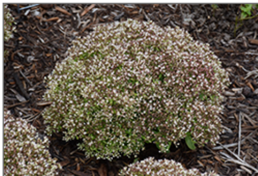
Rock 'N Round Bundle Of Joy Stonecrop in bloom