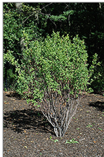
Rainbow Pillar Serviceberry

This is a relatively low maintenance shrub, and should not require much pruning, except when necessary, such as to remove dieback. It is a good choice for attracting birds to your yard, but is not particularly attractive to deer who tend to leave it alone in favor of tastier treats. It has no significant negative characteristics.