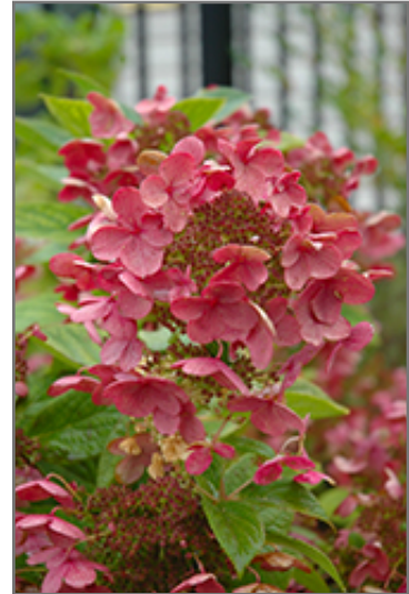
Quick Fire Hydrangea flowers (faded)

This shrub performs well in both full sun and full shade. It prefers to grow in average to moist conditions, and shouldn't be allowed to dry out. It is not particular as to soil type or pH. It is highly tolerant of urban pollution and will even thrive in inner city environments. Consider applying a thick mulch around the root zone in winter to protect it in exposed locations or colder microclimates. This is a selected variety of a species not originally from North America.