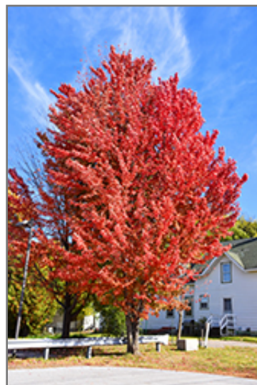
Celebration Maple in fall