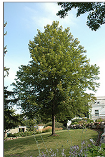
Celebration Maple