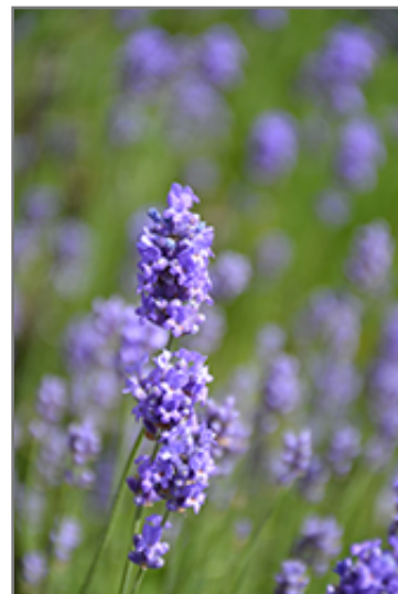
Hidcote Blue Lavender flowers