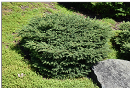
Birds Nest Spruce