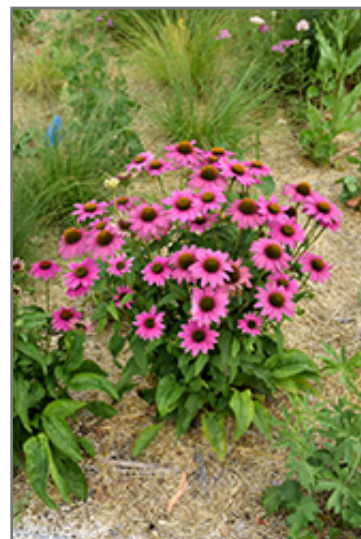
PowWow Wild Berry Coneflower in bloom

This is a relatively low maintenance plant, and is best cleaned up in early spring before it resumes active growth for the season. It is a good choice for attracting birds and butterflies to your yard, but is not particularly attractive to deer who tend to leave it alone in favor of tastier treats. It has no significant negative characteristics.