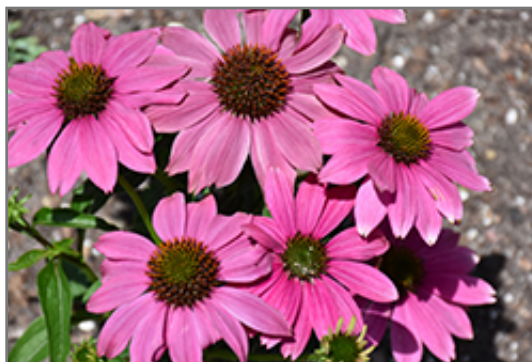
PowWow Wild Berry Coneflower flowers