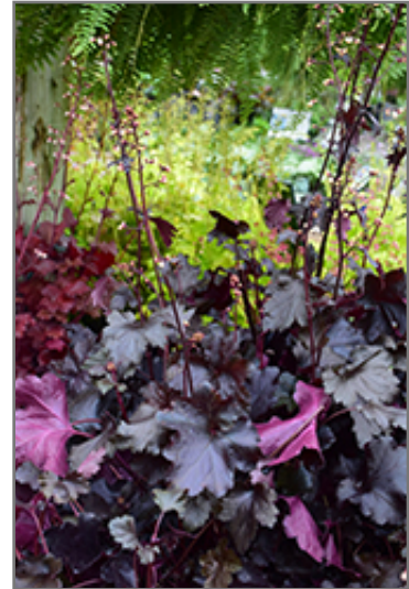
Black Pearl Coral Bells in bloom

Black Pearl Coral Bells is recommended for the following landscape applications;