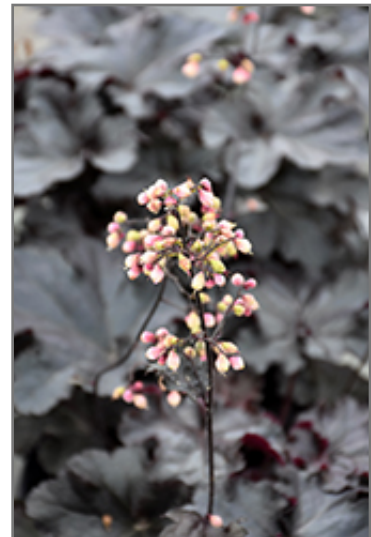
Black Pearl Coral Bells flowers