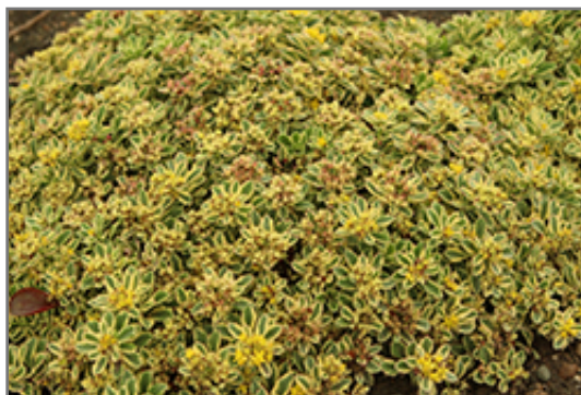
Rock 'N Low Boogie Woogie Stonecrop flowers

Rock 'N Low Boogie Woogie Stonecrop is a dense herbaceous perennial with a mounded form. Its medium texture blends into the garden, but can always be balanced by a couple of finer or coarser plants for an effective composition.