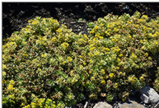
Rock 'N Low Boogie Woogie Stonecrop in bloom