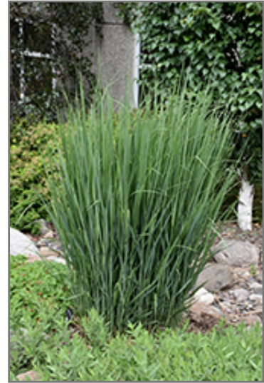
Northwind Switch Grass