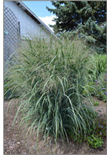
Northwind Switch Grass in bloom

This plant does best in full sun to partial shade. It is very adaptable to both dry and moist locations, and should do just fine under typical garden conditions. It is considered to be drought-tolerant, and thus makes an ideal choice for a low-water garden or xeriscape application. It is not particular as to soil type, but has a definite preference for alkaline soils, and is able to handle environmental salt. It is somewhat tolerant of urban pollution. This is a selection of a native North American species. It can be propagated by division; however, as a cultivated variety, be aware that it may be subject to certain restrictions or prohibitions on propagation.